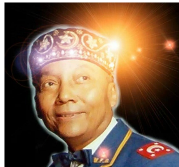
The Honorable Elijah Muhammad Messenger Of Allah

passed down from our former slave masters; these have no righteous meaning, - only that you are still nothing but property to them. They (cont' page 2)